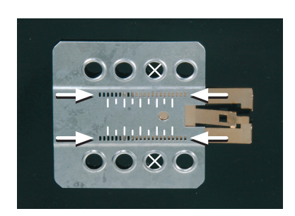
(sample photo) (sample photo)

Mount the metal brackets to the Double-DIN head unit.