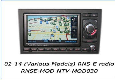
02-14 (Various Models) RNS-E radio RNSE-MOD NTV-MOD030